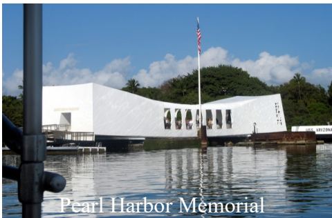
Pearl Harbor Memorial

Day 1—Nov. 2 - Today we take a leisurely bus ride to Atlanta where we will spend the night. We will get up the next day ready for our flight to Honolulu.