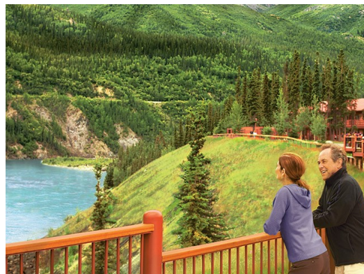
Denali Princess Wilderness Lodge

Day 3 Saturday, May 14 - This morning, you say goodbye to Fairbanks for the spectacular trip to Denali National Park via motorcoach. You'll be welcomed at the Denali Princess Wilderness Lodge for a 2-night retreat. Check in with the Guest Service Desk for help in planning your own Denali adventure like a husky homestead tour, river rafting, hiking, glacier flightseeing or an off-road ATV adventure. Or you may enjoy the spectacular main lodge, river view deck, and Princess Village with the popular Christmas cottage and sugar shack. Be sure to check out Fannie Q's Saloon, named after a famed local homesteader, or sit outside at a fireside patio.